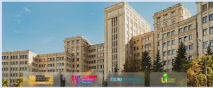
karazin.ua Development Strategy of V. N. Karazin Kharkiv National Uni...