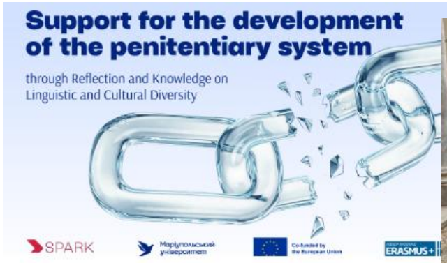
INTERNATIONAL SPARK Education Stitches Society Together: Mariupol State University in the International Dialogue of the SPARK Project