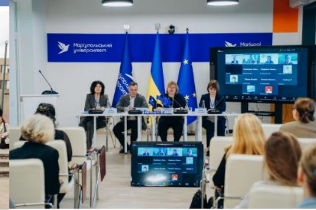
INTERNATIONAL SCIENTIFIC EDUCATION ALL NEWS IC_EU Deeds, not words: MSU discusses value orientation for higher education