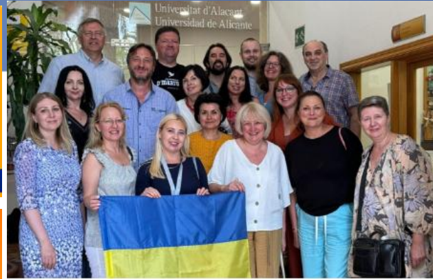
INTERNATIONAL ALL NEWS DIGIUNI Participants of DigiUni Project Report on Their First Achievements