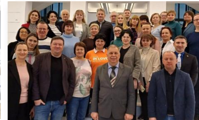
INTERNATIONAL EDUCATION ALL NEWS MSU is a co-founder of Ukrainian Network for Recognition of Prior Learning under QUARSU project