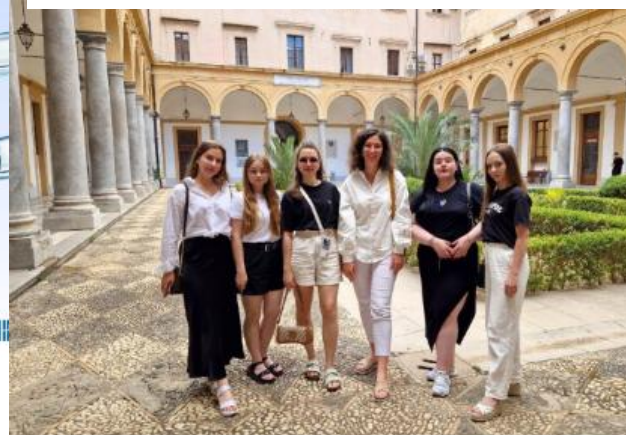
STUDENT EDUCATION ALL NEWS CJLL Environmental Justice: Summer School for a Common Purpose