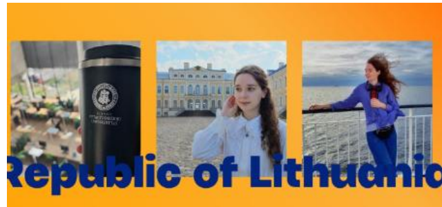
Republic of Lithuania