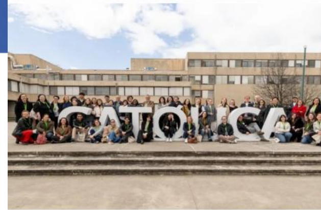
STUDENT INTERNATIONAL ALL NEWS T4EU Dialogue of cultures in Europe: Mariupol State University joined T4EU events in Portugal