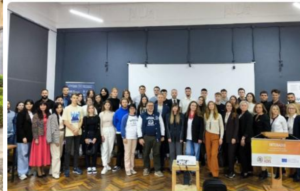
STUDENT INTERNATIONAL ALL NEWS MSU community presents its INTERADIS project results