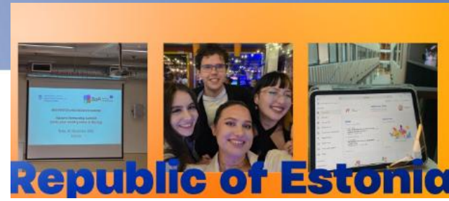
Republic of Estonia