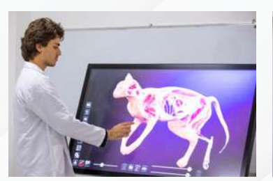
VETERINARY ANATOMAGE LAB