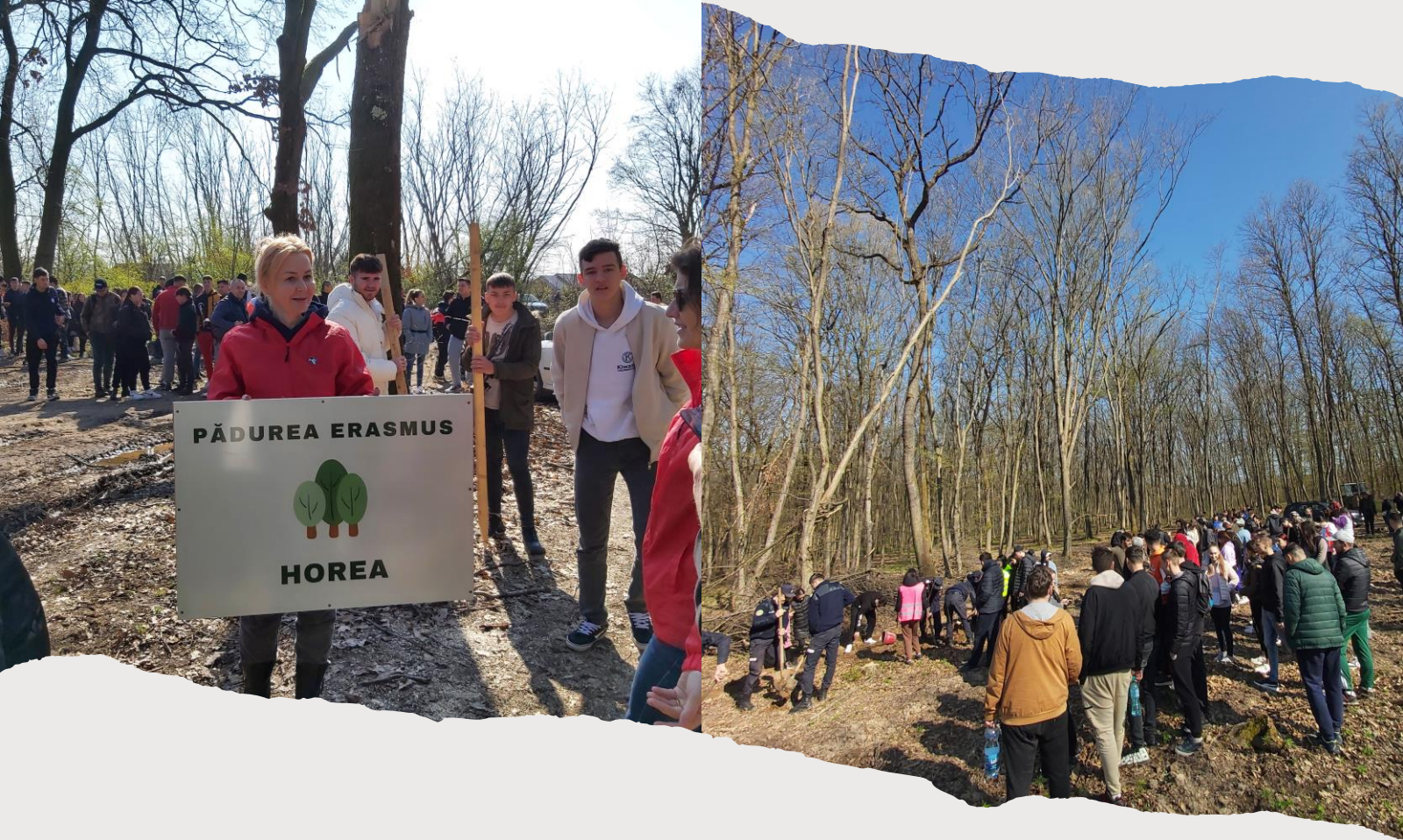
Workshop & Green activity (Erasmus Forest) in Bihor county, March 2024